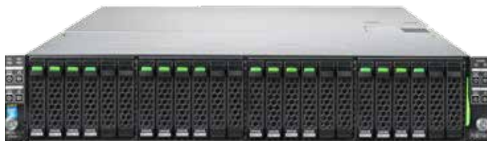
FUJITSU Integrated System PRIMEFLEX for VMware EVO: RAIL front view

Moreover, FUJITSU Server PRIMERGY systems deliver unprecedented performance for virtualized environments based on 20 years of experience gained in server design and engineering. This highly energy efficient and density optimized solution leaves headroom for more required virtualization power: It can be scaled gradually up to 4 appliances resulting in 16 nodes. The entire configuration then would consist of 3.1 TB memory, 32x 10 Gbit/s Ethernet connectors, and 58 TB storage capacity, to host 400 server virtual machines or 1.000 desktop virtual machines.